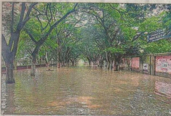
A view of a flooded area as incessant rains continued to pound Manipur capital Imphal on Friday.