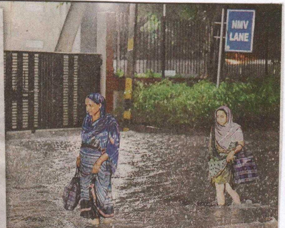
Near BJP headquarters