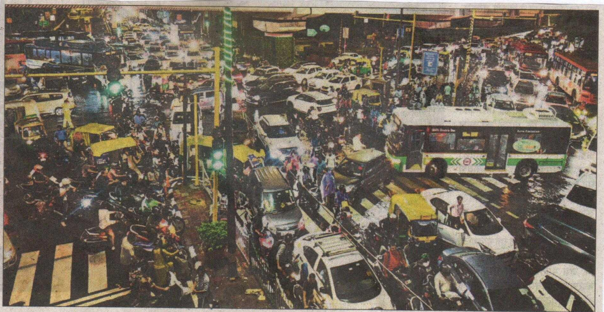
तिलक ब्रिज में भारी बारिश के बाद एक बार फिर पानी भर गया। इस कारण आसपास के इलाकों में घंटों तक भीषण जाम लगा रहा।

राजधानी में तीन घंटे की बारिश ने गर्मी से राहत दी, लेकिन जलभराव से बुरा हाल, मयूर विहार इलाके में सबसे ज्यादा 119 मिमी के करीब पानी बरसा