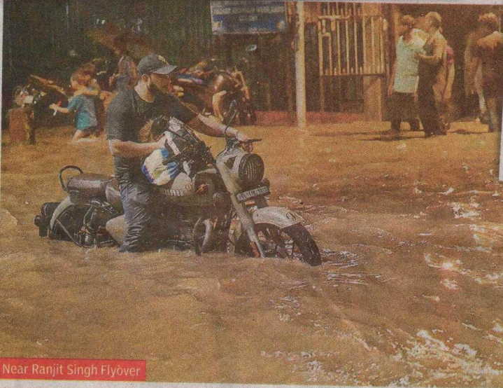
Near Ranjit Singh Flyover