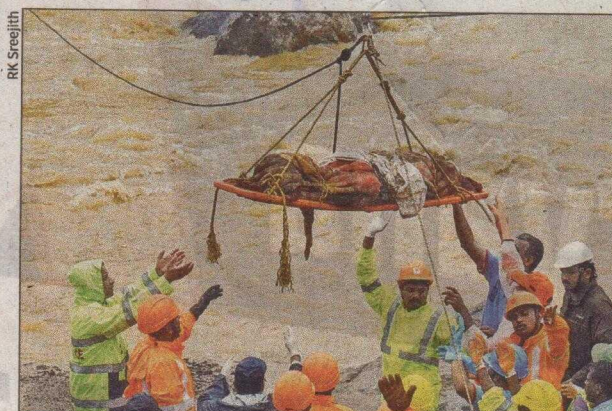
Rescue workers lift a body to Chooralmala in Wayanad as the bridge from Attamala has collapsed. The toll has risen by almost 50 since Tuesday

operation made more challenging by intermittent rain. CM Pinarayi Vijayan said 1,592 people have been rescued in two days and efforts would continue till the last possible survivor is saved. Unofficial estimates peg