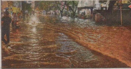
A flooded road in Old Rajinder Nagar, where 3 IAS aspirants died last week, after Wednesday evening's downpour

OUTLOOK: Light to moderate rain likely over next 2 days