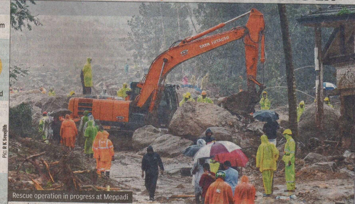
Rescue operation in progress at Meppadi

₹5cr financial support to Kerala announced by TN CM M K Stalin was handed over by public works minister E V Velu to Kerala CM Pinarayi Vijayan as a cheque at Kerala Secretariat