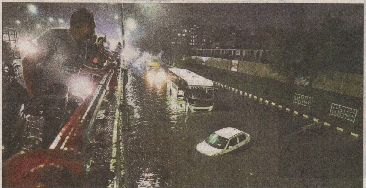
मयूर विहार फेस-2 में एनएच-24 के पास एक बस और कार चालक जलभराव में फंस गए। वहां से गुजर रहे लोगों ने कड़ी मशक्कत के बाद दोनों को बचाया।