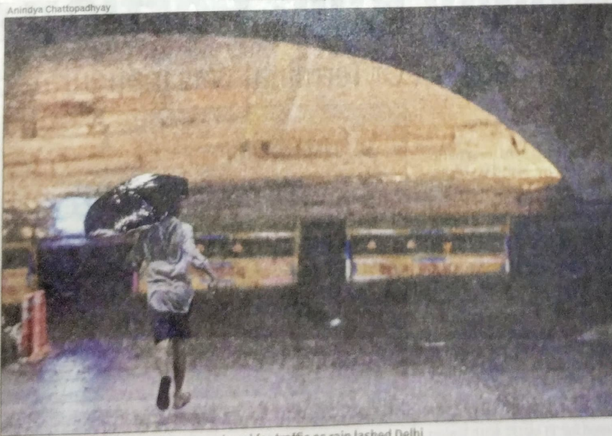
USUAL SUSPECT: Minto Bridge was closed for traffic as rain lashed Delhi