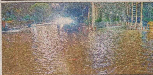
पूसा रोड (ऊपर) का हाल, प्रगति मैदान (नीचे) 4 फुट तक पानी भरा।

■ एनबीटी न्यूज डेस्क, नई दिल्ली: दिल्ली में बुधवार को करीब एक घंटे में 100 मिलीमीटर से ज्यादा बारिश दर्ज की गई। इसके बाद कई इलाकों में जलभराव हो गया। मौसम विभाग ने रेड अलर्ट जारी किया है। भारत मौसम विज्ञान विभाग (IMD) ने बताया कि प्रगति मैदान इलाके में