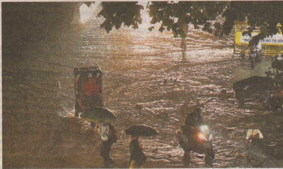
Road turns to river: Waterlogging was reported at several places in the Capital, causing hours-long traffic snarls and widespread flooding in commercial and residential areas.

The torrential downpour prompted the India Meteorological Department (IMD) to issue its highest 'red' alert warning for the