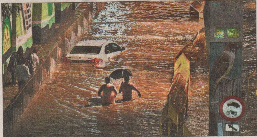
दिल्ली में बुधवार शाम मूसलाधार बारिश के कारण आईटीओ इलाके में जलभराव हो गया। इससे कई वाहन दूब गए।

रात 11 बजे नाले से बरामद किया गया मां-बेटा का शव: खोड़ा में मां-बेटा के बहने की सूचना मिलते ही प्रशासन तुरंत हरकत में आया। राहत-बचाव दल ने रात करीब 11 बजे मां-बेटे का शव नाले से बरामद कर लिया। अस्पताल ले जाने पर डॉक्टरों ने दोनों को मृत घोषित कर दिया। शव को पोस्टमार्टम के लिए भेज कर पुलिस घटना के कारणों का पता लगाने में जुट