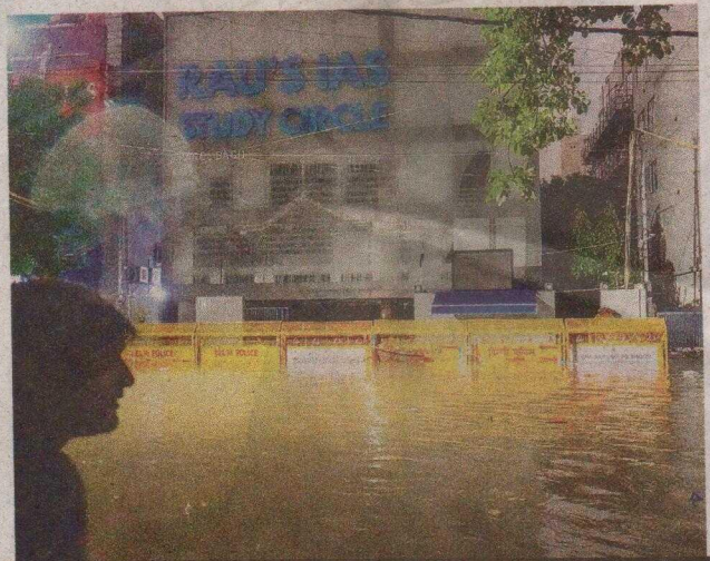
Rau's IAS Study Circle where flooding killed three students recently