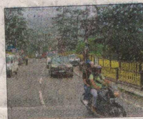
Heavy rain lashes Shimla.

The department had issued orange alert for heavy to very heavy rainfall for today as well. Light to moderate rain was recorded at several places over the last 25 hours, with Una, Dharamsala and Manali recording