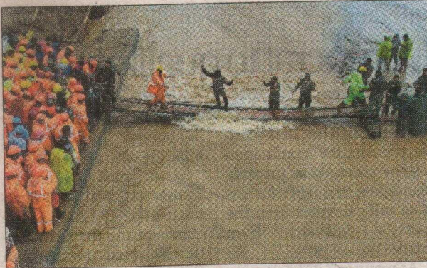
Rescue teams cross a temporary bridge in Wayanad, Kerala.