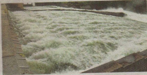
A late evening alert said that the discharge from Krishnaraja Sagar dam had been increased to 1.7 lakh cusecs.

The outflow from KRS, which had increased to 1.5 lakh cusecs on Tuesday