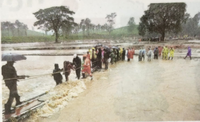
Path to safety: People stranded at Attamala after a massive landslide in Wayanad cross the temporary bridge on Wednesday.

Answering a Calling Attention Motion in Rajya Sabha, Mr. Shah said the Centre issued the first warning on July 23 and repeated it on the next three days. Citing the examples of Odisha and Gujarat where "zero-casualty disaster management" was done, he asked why the Kerala government did not evacuate people from the