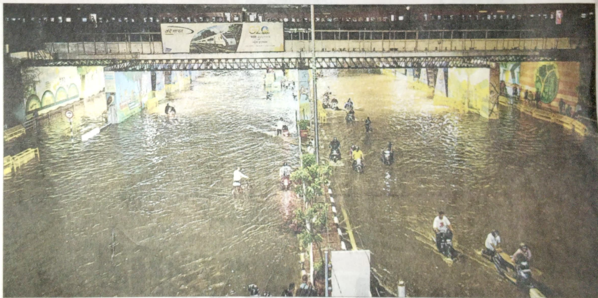
Commuters waded through a completely waterlogged road under the Tilak Bridge in central Delhi on Wednesday evening.

The Mayur Vihar weather station recorded 119mm of rainfall in a three-hour spell between 5.30pm and 8.30pm, of which 89.5mm of rain was recorded