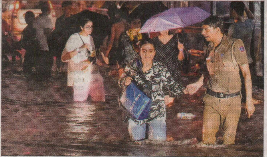
HELPING HAND: A woman being assisted by a police official while wading through a waterlogged road during rain near Old Rajinder Nagar area in New Delhi on Wednesday.

In response to the torrential rain, AAP minister Atishi wrote on X, "Delhi witnessed very heavy rainfall. The Delhi Government and MCD are closely monitoring low-lying areas and vulnerable locations to ensure no untoward incidents occur." Despite these assurances, the conditions on the ground painted a starkly different picture.