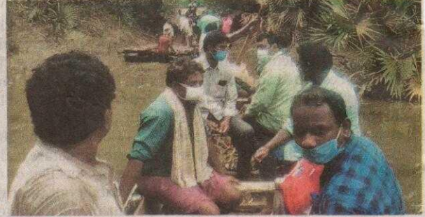
Risky ride: People crossing the Kothuru causeway on a country boat in the Agency area of West Godavari district.

At the Sir Arthur Cotton Barrage at Dowleswaram near Rajamahendravaram, Irrigation officials dis-