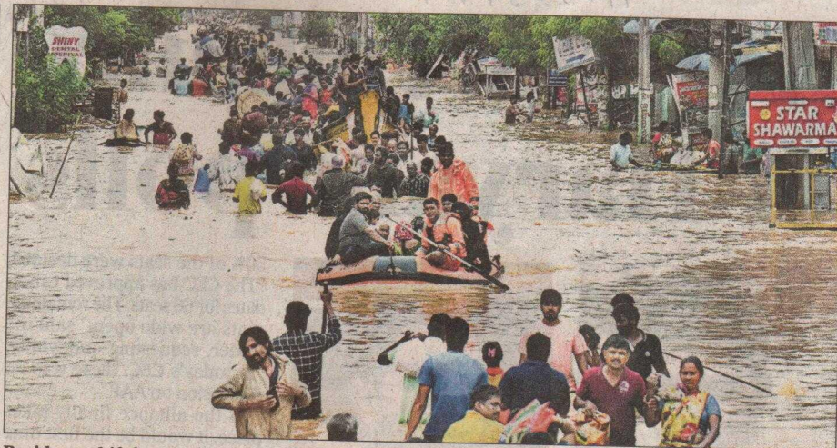
Residents shift from a flooded area in Vijayawada on Tuesday.