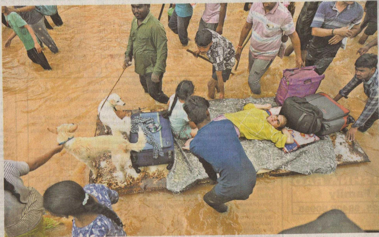
Hard-hit: A makeshift raft being used to transport people, pets and belongings to the Singh Nagar flyover, where ambulances were available, in Vijayawada on Tuesday.

Nine deaths were reported in NTR district and seven in Guntur district. A death was reported in Palnadu district when persons riding a two-wheeler were washed away in a stream. Agricultural crop loss was reported in 1,80,244 hectares in 20 districts. Horticultural crops in 15,109 hectares were reportedly affected by the flood.