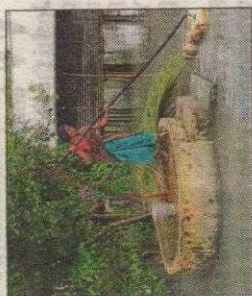
A flood-resistant village in Lakhimpur district in Assam.