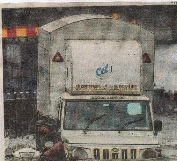
A vehicle stuck on a waterlogged street following heavy rain in Mumbai.