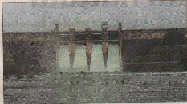
All four crest gates of Harangi reservoir in Kodagu were opened to let out excess water on Monday.

The hilly district had recorded an average of 45.52 mm of rain in the last 24 hours. It was 19.11 mm in the corresponding period, last year. Incessant rain in Chikkamagaluru district has upped the water levels of Tunga, Bhadra and Hemavathi rivers. Heavy