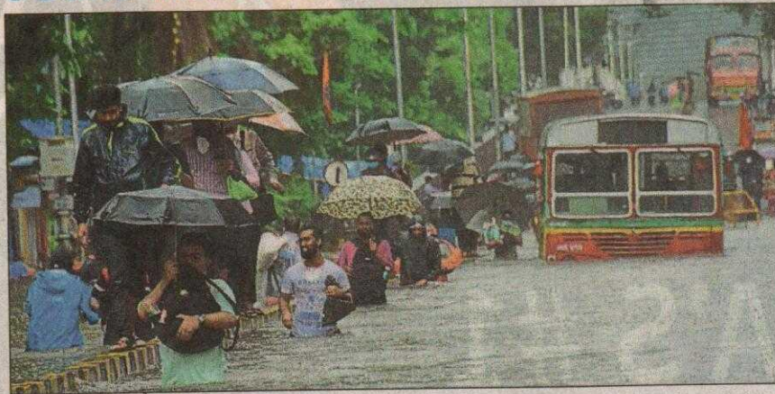
■ Commuters waded through a waterlogged street in Mumbai on Tuesday.

■ Heavy rainfall in the Mumbai Metropolitan Region claimed three lives in separate incidents, as the monsoon woes of waterlogging, damaged structures, suspended trains and traffic jams resurfaced.