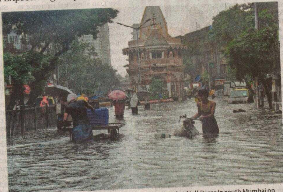
Monsoon blues: People wade through a waterlogged road at Null Bazar in south Mumbai on Tuesday after heavy overnight rain. ■ VIVEK BENDRE

Waterlogging outside the civic-run Nair Hospital in central Mumbai, where several COVID-19 patients from the city are being treated, posed a problem for its medical staff. "Nurses and other medical staff have been struggling to reach the hospital due to waterlogging on the premises and elsewhere," a resident doctor from