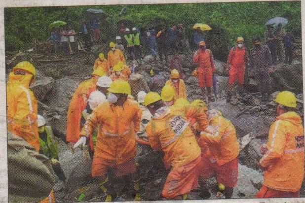
A body being retrieved from Rajban village in Mandi on Tuesday.

Meanwhile, the overall rainfall this monsoon is still lower than normal. As against the normal rainfall of 415.3 mm, the state has received 287.3 mm rain, a deviation of -31 per cent. The month of July recorded a deviation of -29 per cent. The precipitation received in July is the lowest in the state since 2011.