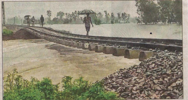
यूपी के पीलीभीत में सोमवार को शारदा नदी में आई बाढ़ के बाद एक पुलिया के बह जाने से हवा में लटकी रेल की पटरियां।