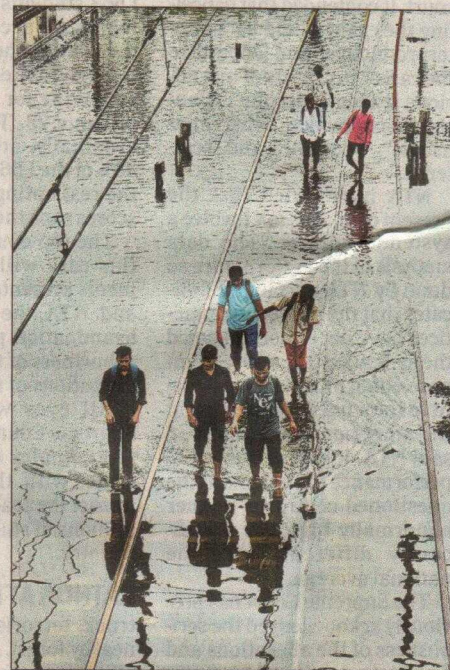
SDRF personnel rescue people from a flooded area in Champawat district of Uttarakhand; people cross a waterlogged railway track in Mumbai, on Monday.