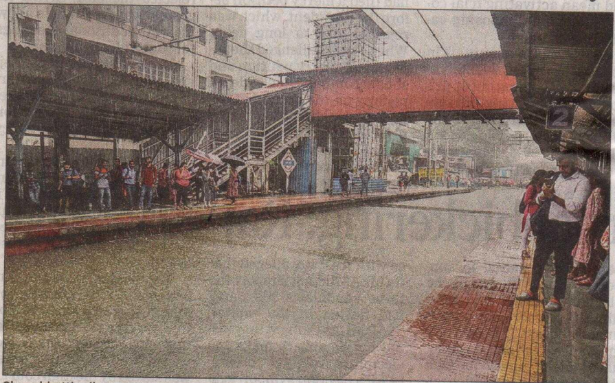
Chunarbhatti railway station after Monday's downpour. The 268mm of rain in 24 hours recorded at Santacruz was the second-highest July rainfall in the past 15 years

A mudslide displaced residents of a colony near Nehru Nagar in Vile Parle, while a minor landslide befell Vikhroli Park site. A total of 79 incidents of tree- and branch-fall were reported to BMC. Cases of wall and house collapse numbered 11 and as many incidents of short-circuit were recorded.