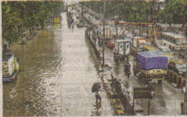
Maximum trouble: A waterlogged road at Kings Circle in Mumbai on Monday. EMMANUAL YOGINI

"Heavy rain in some low-lying areas led to waterlogging and disruption of suburban train services.