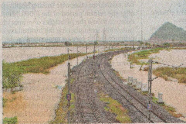
Submerged: A railway track near Vijayawada has been flooded in the heavy rain on Sunday; flood water being released from the Mahbub Sagar Tank in Sangareddy district of Telangana on Sunday.

A minor landslide was reported at Ramakrishna Na-