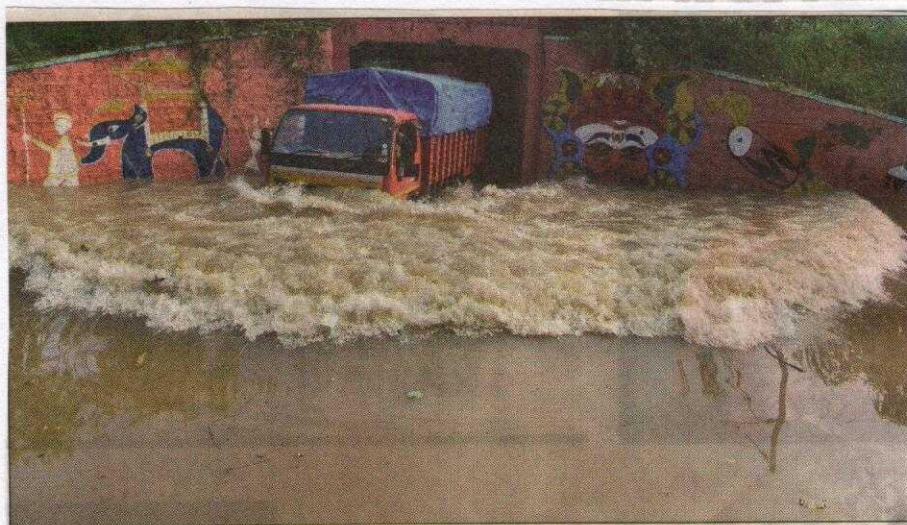
A waterlogged railway underpass near Nagashettyhalli on Wednesday, following heavy rainfall on Tuesday night.