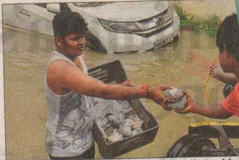
Volunteers distribute food packets to the residents of Sri Sai Layout in Hennur. (R) A family cleans their home at Pramod Layout near Nayandahalli.

Several electronic equipment, cars, bikes and furniture