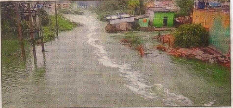
The spillover from Mallapur lake floods the village on the outskirts of Chitradurga on Wednesday following the overnight showers.

Vast tracts of paddy crop have been inundated following the torrential rain in Da-