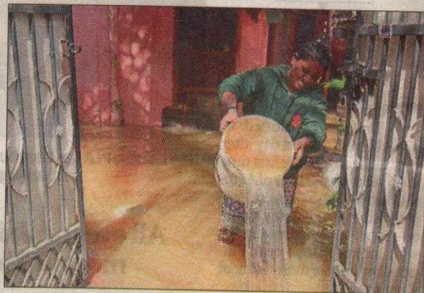
A woman tries to drain rainwater out of her house in Sri Sai Layout, Hennur.