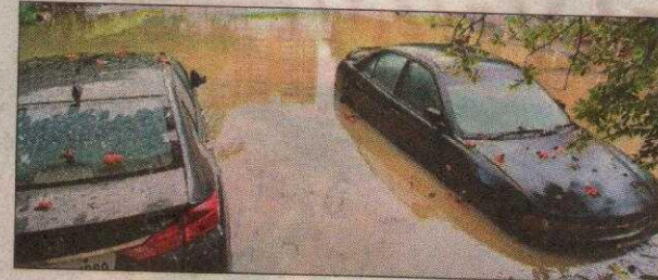
Vehicles on a flooded street of Dollars Colony on Wednesday.

Nearly four feet of water from overflowing drains flooded 100 homes, including those