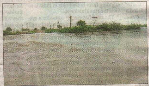
The Hirehalli stream in Siruguppa taluk, Ballari district, in full flow following copious rains in the last few days.

The India Meteorological Department has predicted very heavy widespread rain for three coastal districts for the next two days.