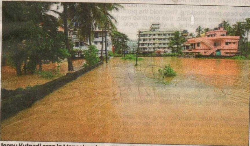
Jeppu Kutpadi area in Mangaluru is marooned following heavy rain on Friday.