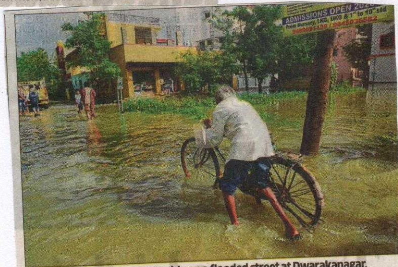
A cyclist struggles to ride on a flooded street at Dwarakanagar, Chikkabanavara, after a drain breached.