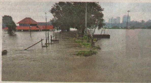
The Mahadeva temple in Aluva on the banks of the Periyar is almost submerged following incessant rain on Tuesday.

Fire and Rescue Services personnel in Palakkad rescued four people, including an elderly woman, trapped in the Chitturpuzha, near