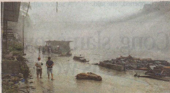
Treacherous path: A flooded road along the swollen Teesta river after heavy rainfall in Sikkim on Monday.

June 12 wreaked havoc in Mangan, causing multiple landslips, and severing connectivity. Due to the blockage of various roads at several locations, 1,200 to 1,500 tourists got stranded in Lachung town, officials said.