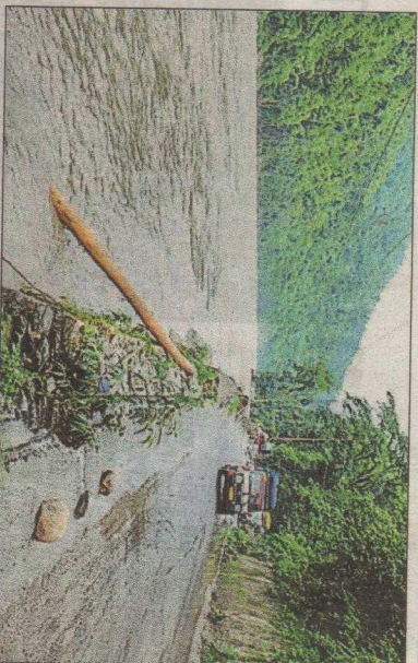
A vehicle moves on a road along the swollen Teesta river after heavy rainfall in Sikkim.

While flying in to rescue the tourists, these helicopters would