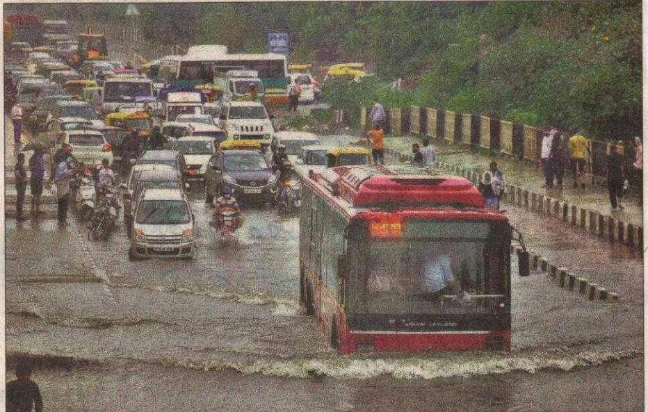
■ Vehicular movement slowed down in several areas due to water-logging after the rainfall on Monday. IMD has predicted more rain in the next two days.

"Immediately after receiving information about water logging, we installed temporary pumps and cleared roads of water within 15-20 minutes. Since the rainfall was not heavy, water logging took place at fewer places than usual," the PWD official said.