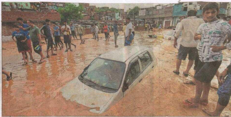
People stand next to a car partially covered in mud due to flooding after a heavy monsoon rainfall in Jaipur on Friday.