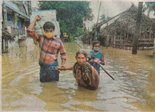
Homes submerged: A family wading through a flooded street in East Godavari district on Monday.