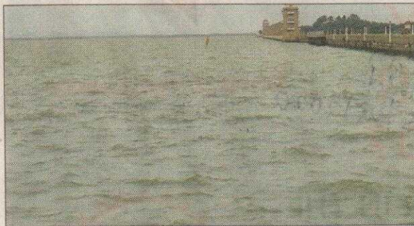
Tungabhadra reservoir is just three feet short of its full reservoir level. The live storage level in the dam stands at 91.98 tmcft as against its full capacity of 101 tmcft.

With the dam nearing full capacity, the Tungabhadra Board has sounded a flood alert for three basin districts in Karnataka and two in undivided Andhra Pradesh as there is a possibility of releasing water