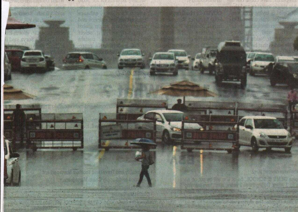
Hazy Capital: Vehicles moving past Rajpath in New Delhi during showers on Monday.