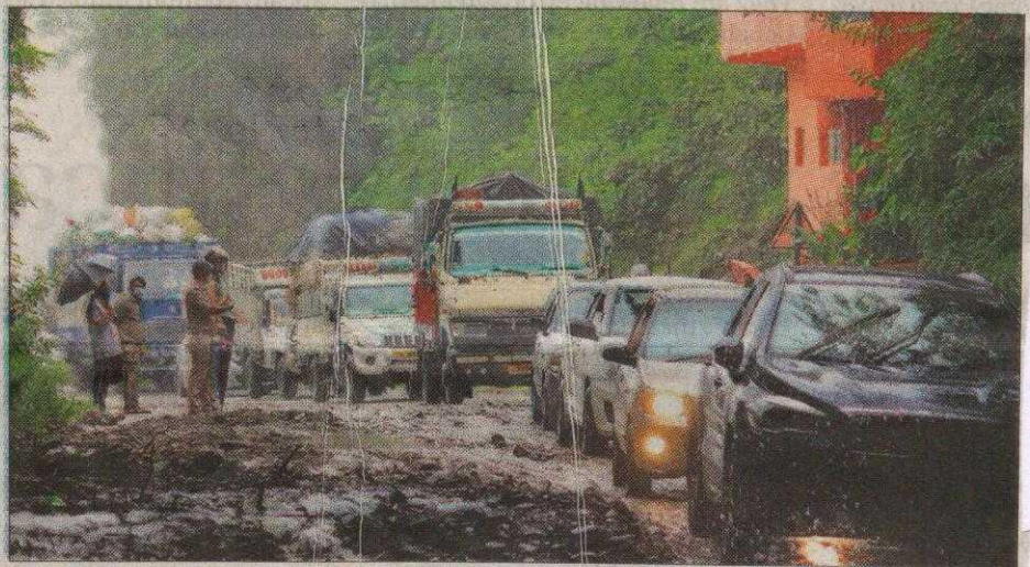
The Kangra-Ranital highway blocked due to a landslide caused by rains on Monday.

The Public Works Department (PWD) authorities deployed JCB machines to clear the debris, which took about six hours, to open the road. The stretch near Kangra is prone to landslides as the hills have been cut for road widening.