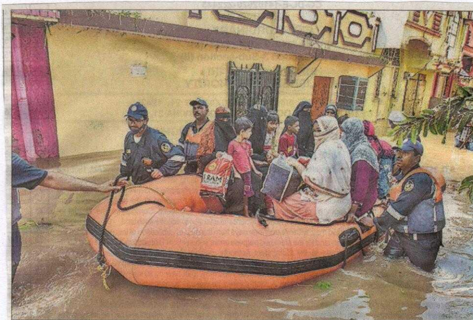
Officials carry out a rescue operation in Hyderabad on Sunday.