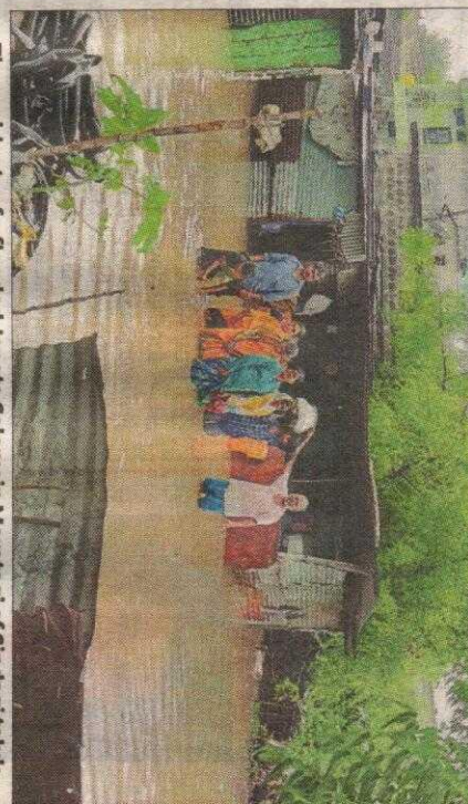
The residents of a flooded Janata Colony in Moratagi of Sindagi taluk, Vijayapura district, move to safer places.

K KALABURAGI/MJAVAPURA/BAGALKOT/HUBBALLI, DHNS Heavy showers on the intervening night of Tuesday and Wednesday paralysed normal life in Kalyana Karnataka districts - Kalaburagi, Bidar, Yadgir and Raichur.