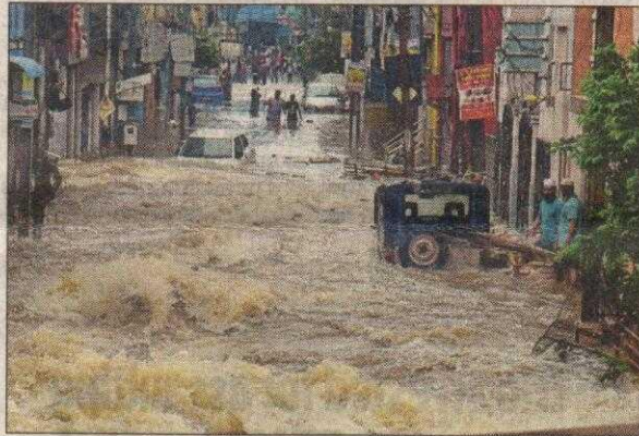
Floodwater gushes through a street following heavy rains in Hyderabad on Wednesday.