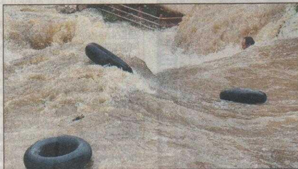
A man struggles to stay afloat in gushing floodwaters. (PTI)

Buildings and vehicles lie partially submerged in floodwaters in Hyderabad on Wednesday. A wall collapsed, killing nine persons in the capital of Telangana, while three others died elsewhere. Many parts of the city had received more than 25cm of rainfall over the past 24 hours, a government official said. Authorities declared a holiday on Wednesday and Thursday and asked residents to stay indoors. Text by Reuters and PTI picture