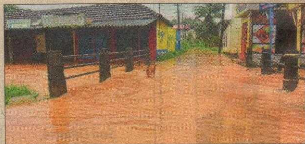
A view of a flooded low-lying area at Kottara Chowki in Mangaluru on Wednesday.

in coastal districts have been experiencing heavy showers since Tuesday night.