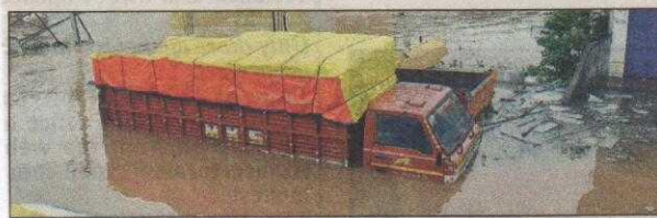
Vehicles submerged in floodwaters.