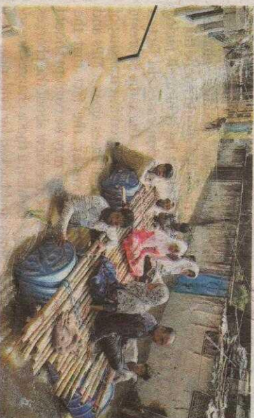
Tough times Residents being shifted from a flooded street near Balapur in Hyderabad on Sunday.

The entire district administration, GHMC Commis-