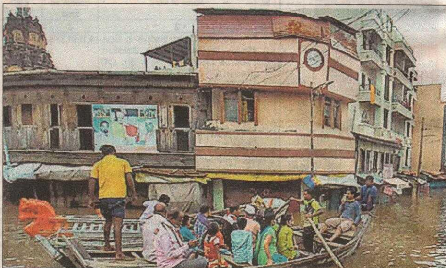
People use a boat to tide over floodwater in Pune's Pandharpur on Friday.

Deputy chief minister Ajit Pawar reviewed the flood situation in western Maharashtra and asked the administration to prepare 'panchnama' (inspection report) of damaged crops, houses and other properties immediately.