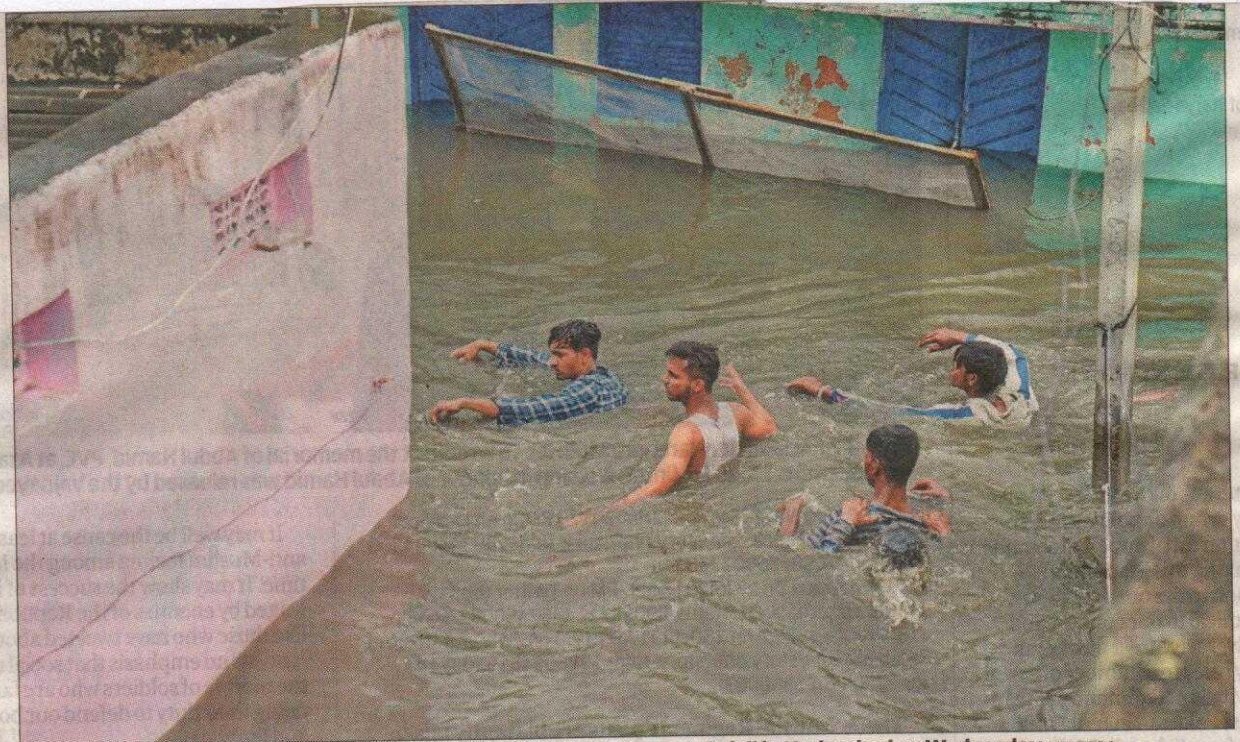
Residents wade through a waterlogged alley after heavy rainfall in Hyderabad on Wednesday.