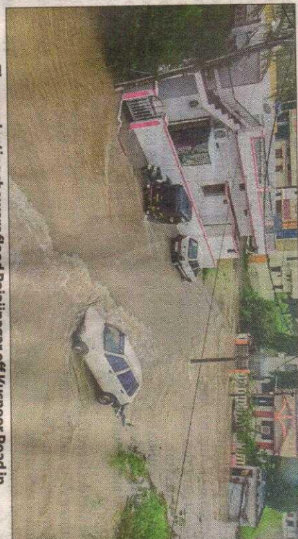
The unrelenting showers flood Rajajinagar off Kusnoor Road in Kalaburagi on Wednesday.