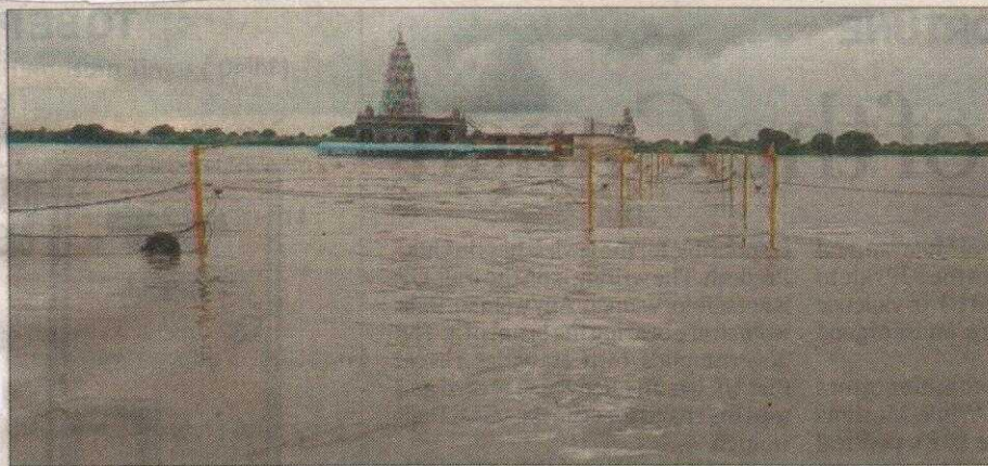
The Yellamma temple at Mannur village of Afzalpur taluk, Kalaburagi district, goes under the floodwaters of Bhima river on Thursday.

दिनांक .16./10./20.. को निम्नलिखित समाचार पत्र में प्रकाशित मानसून/ बाढ़ सम्बन्धी समाचार