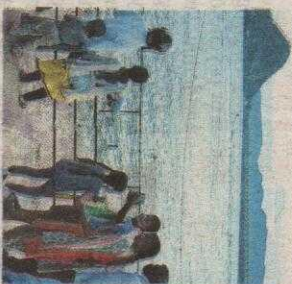
Water being discharged downstream of Prakasam Barrage.

The discharge as of 7 p.m. was 6.15 lakh cusecs. It was 5.70 lakh cusecs at 6.30 a.m. As of 6 p.m., the discharge at the Srisailem project was 5.09 lakh cusecs. It was 5.23 lakh cusecs at Pulichintala. The inflows and outflows at the barrage was more than 6 lakh cusecs throughout the day. A similar situation was likely to continue for another day, officials said.