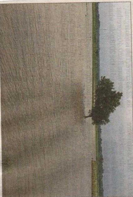
A farmland under water in Kelavadi village of Badami taluk, Bagalkot district.