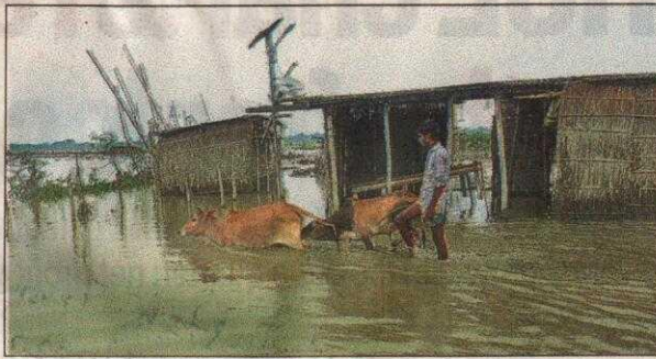
■ A man shifts his cattle to a safer place at Puthimari village in Darrang on Tuesday.

In Meghalaya, at least five people have lost their lives and over a lakh have been affected in the