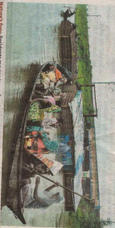
Nature's fury: Residents moving to a safer place in Muzaffarpur on Tuesday.

On Tuesday, 4.25 lakh cu-secs was discharged from the Valmikinagar barrage on the Gandak in West Champ-