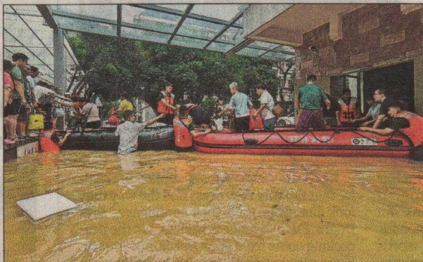
Paramilitary police officers help transfer stranded people at a flooded hospital following heavy rainfall in Guilin, Guangxi Zhuang Autonomous Region, China, on Thursday.

The heaviest rains were from Sunday into Tuesday, toppling trees and collapsing homes. A road leading to Meixian district completely collapsed during the heavy rains. The Songyuan river, which winds through Meizhou, experienced its biggest recorded flood, according