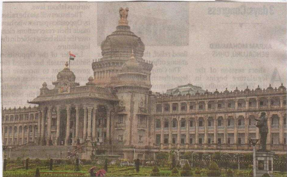
Dark clouds gather over the Vidhana Soudha.

Heavy rain submerged cars in the parking lot of the Krishna Mutt in Udupi on Sunday. Unrelenting showers have left Udupi and Dakshina Kannada districts marooned. Flash floods and landslides returned to haunt Kodagu. The swollen Cauvery has sparked flood fears in many towns and villages.