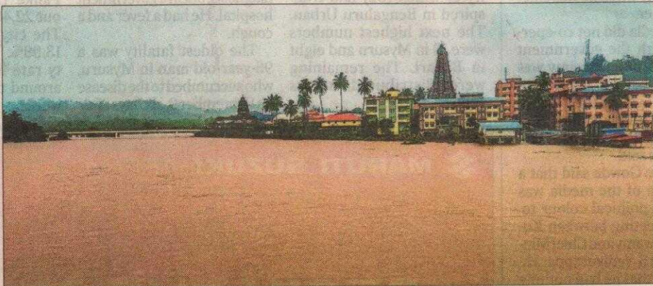
River Tunga is in spate in Sringeri, Chikkamagaluru district.

According to Karnataka State Natural Disaster Monitoring Cell dashboard, more than 100 mm rainfall was recorded in 12 hours in many stations of Uttara Kannada and Udupi districts.