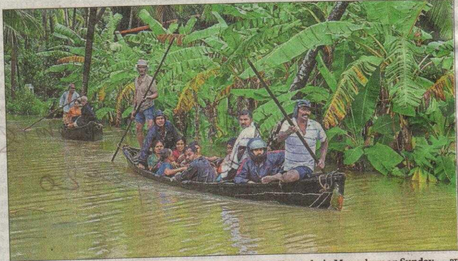
NDRF personnel rescue villagers from Udupi and Dakshina Kannada, in Mangaluru on Sunday.

As of Monday, the monsoon is 7% excess this year, although there are significant variations across regions. It is 29% excess over the southern peninsula, 14% excess over central India, 1% excess over northeast India, but 16% deficient over northwest India. Since a plus/minus 19% deviation from the long period average is counted as normal, this means rainfall is normal in three of the regions, and above normal in the fourth.