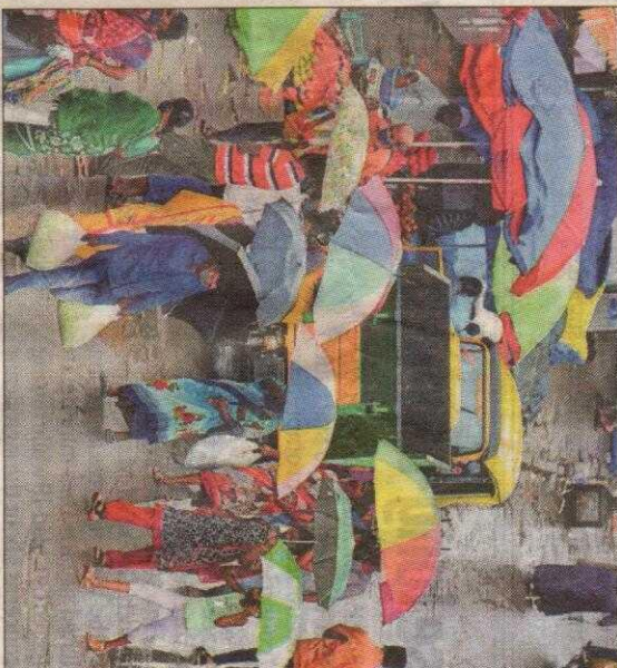
A little rain cannot stop them from shopping.

No tree falling had been reported and zonal officials are attending to damages caused due to the rain.