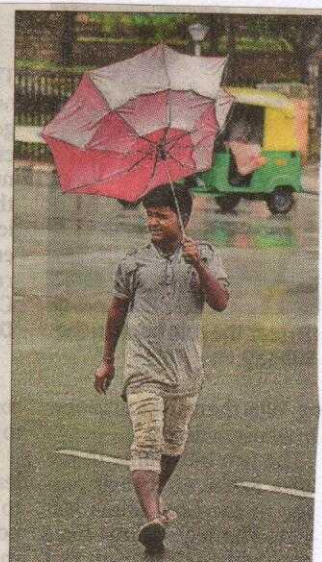
Citizens enjoy the rain at BR Ambedkar Veedhi on Sunday.