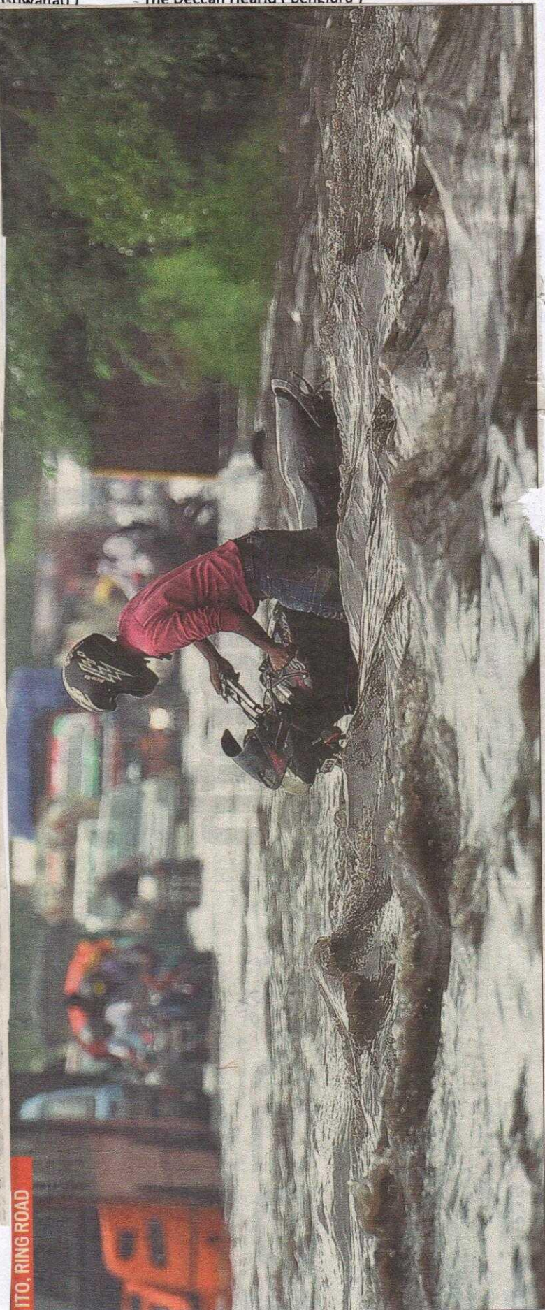
ITO, RING ROAD

According to IMD's Wednesday bulletin, rain intensity and distribution over northwest India was likely to reduce significantly from Thursday but widespread and heavy rain is likely over central, east, northeast India and Maharashtra during the next three days.