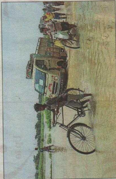
• A flooded street in Birnhum, West Bengal, on Wednesday.

Followed by a discharge of around 3.50 lakh cusecs of water from the Valmikinagar barrage in Nepal, water from an aggravated Gandak river early on Wednesday morning inundated low-lying areas of Bagaha, Gopalganj and Vaishali in Bihar.