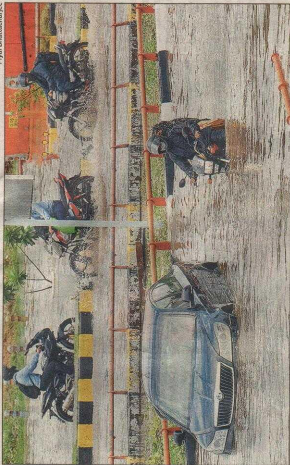
While waterlogging was reported from over 50 sites, gusty winds led to trees falling at more than 30 locations

would be deployed at vulnerable spots like Minto Road and Rohtak Road to divert traffic.