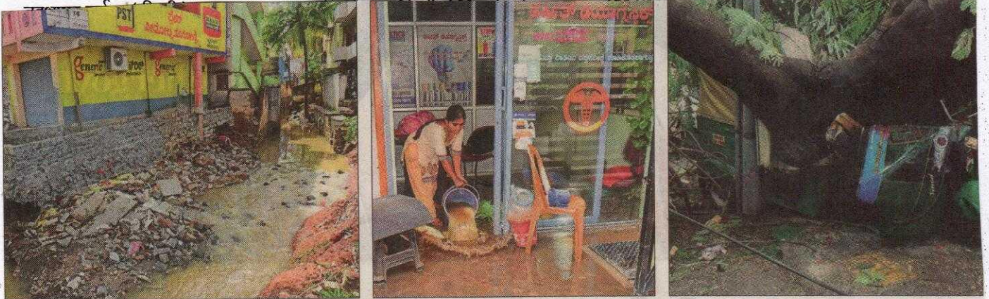
A stormwater drain in Rukmini Nagar, T Dasarahalli, which breached following heavy rain on Monday night. (Centre) A woman clears out floodwater from her house in Rukmini Nagar. (Right) A large tree crashing on an auto in Vidyanarayanagar.