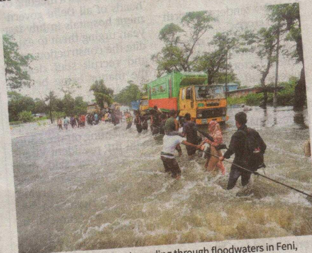
Common concern: People wading through floodwaters in Feni, Bangladesh, on Thursday.

Later in the day, Indian High Commissioner to Bangladesh Pranay Verma met Chief Adviser to the interim government of Bangladesh, Mohammad Yunus, in Dhaka and expressed "concern" about the heightened se-