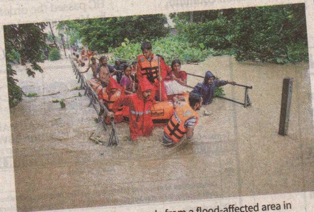
NDRF members evacuate people from a flood-affected area in Adhaynagar village on the outskirts of Agartala on Thursday.

is above the danger mark in Dhalai, Khowai, South Tripura, West Tripura, North Tripura and Unakoti districts.