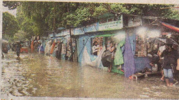
Under water: People waiting under the sheds of bookshops along the roadside due to waterlogging after heavy rain in Kolkata on Saturday.

Many parts of Kolkata were submerged on Saturday. Traffic was disrupted in several areas due to waterlogging. Low lying areas like Behala, Central Ave-