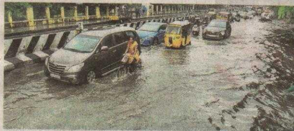
Vehicle moving through flood water on Poonamallee High Road after heavy rain lashed Chennai.

Until early Tuesday, meteorologists had forecast a 'severe cyclone' but now say it will intensify further to be labelled a 'very severe cyclone'. This is just a step below the strongest possible classification of an 'extremely severe cyclone'.