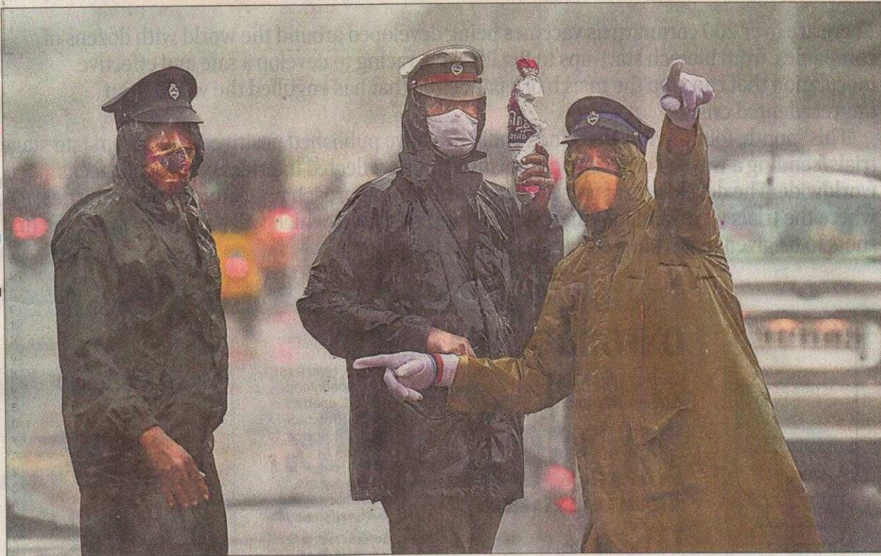
Police personnel manage traffic during heavy rainfall ahead of the expected landfall of Cyclone Nivar in Chennai. The cyclone is expected to make landfall between Mamallapuram and Karaikal on Wednesday evening, according to IMD. Related story on page 7