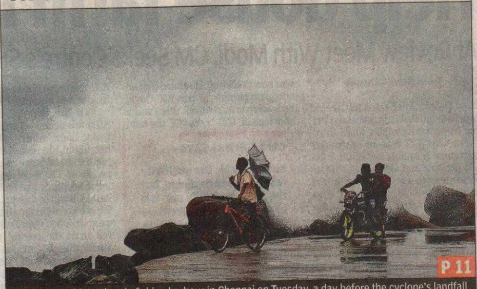
Strong waves hit Kasimedu fishing harbour in Chennai on Tuesday, a day before the cyclone's landfall