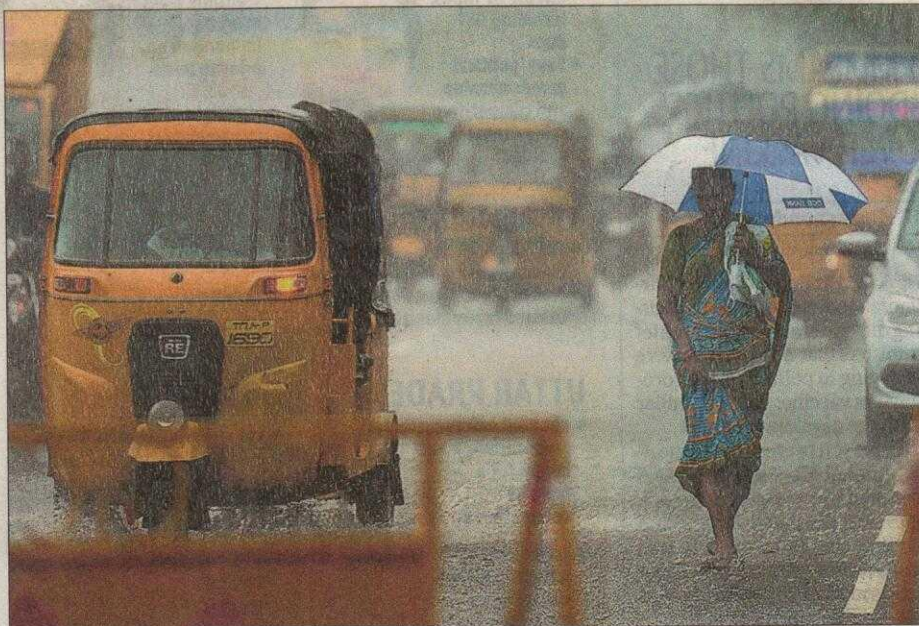
A woman passes by as heavy rain lashes Chennai on Tuesday.