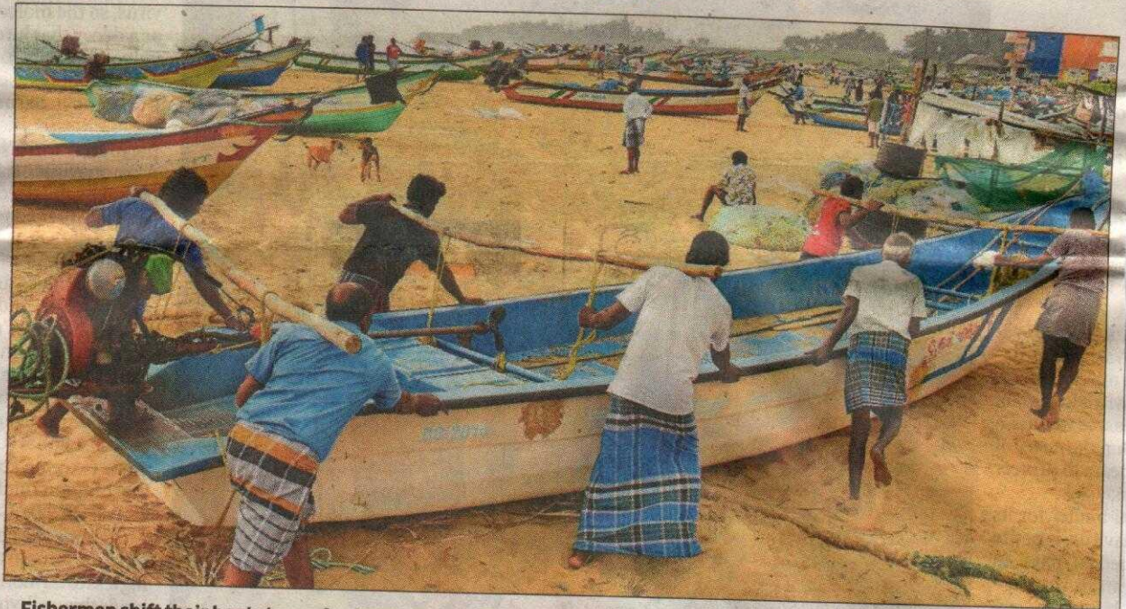
Fishermen shift their boats to a safe place following Cyclone Nivar alert, in Mamallapuram in Tamil Nadu, on Monday.