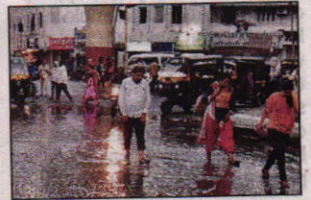
RELIEF, AT LAST: Monsoon arrives in Nagpur on Sunday

'Weak El Nino may have had an impact on monsoon'