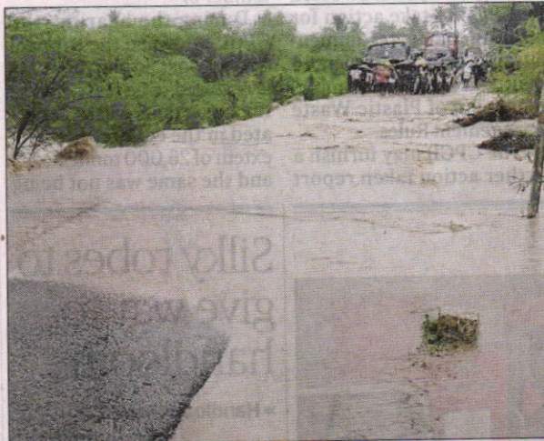
A stream overflowed affecting road connectivity at Gojanuru village in Lakshmeshwar, of Gadag district.

MLA Prasad Abbayya, who visited the affected areas had to wade through knee-deep water on Mattur Road. Source