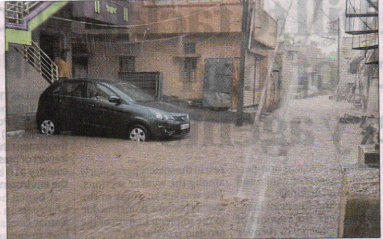
There was sparse vehicle movement as heavy rain lashed Hubbali on Sunday evening. (Right) A flooded road in Badami of Bagalkot district following heavy showers.