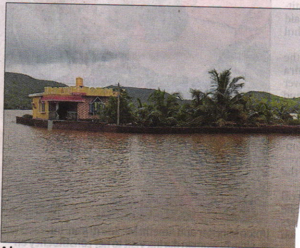
A house marooned following heavy rain in Poojageri village of Ankola taluk, Uttara Kannada district. DH PHOTO

There was drizzle in many parts of coastal Uttara Karnataka. Kumta, Honnavar,