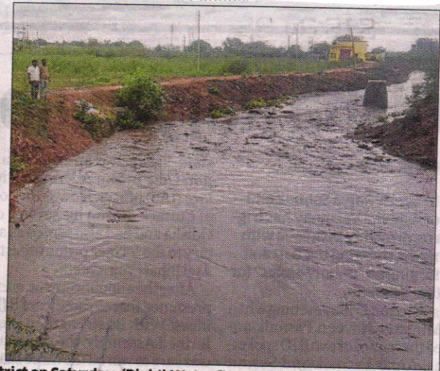
A man wades through waist-deep water in Poojageri village of Ankola taluk, Uttara Kannada district on Saturday. (Right) Water flows through a canal in Lakshmeshwar of Gadag district, following heavy rain.