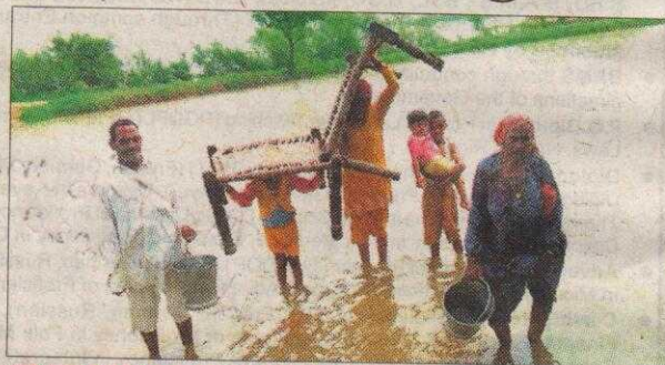
'EXTRACTION WORK ON'

According to information, nearly 100 'dhanis' are affected in Sulkhani, Dhansu, Ghiray, Chainat and Bugana villages after rain lashed the region last week. Though many residents have been staying put despite being cut off from other places, nearly 60 inmates of 20 'dhanis' left after water entered their houses.