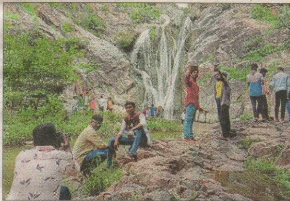
The Nazrapur Falls in Gurmatkal taluk, Yadgir district, comes alive following the copious rain in the region for the past one week.