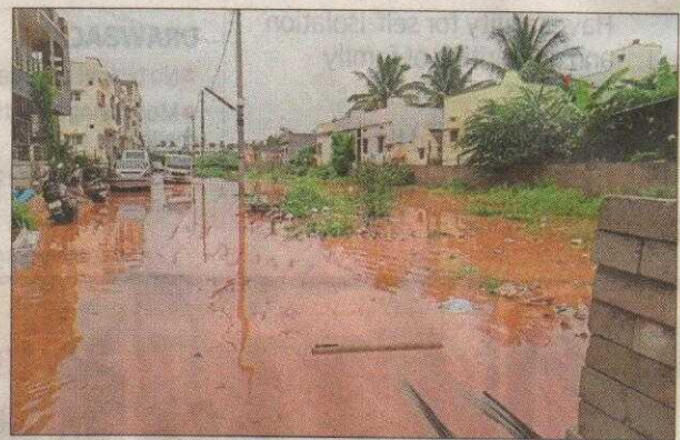
A link road between Shadi Mahal and Budga Jangama Colony in Hosapete is inundated after a breach in Jambunath Gudda stream on Saturday. The town received 8.2 cm of rain between Friday night and Saturday morning.