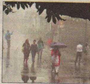
Widespread rain lashed the state on Monday.

Heavy rain lashed parts of Kangra and Mandi districts. Palampur was the wettest with 85 mm rain while Jogin-