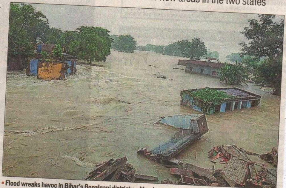
■ Flood wreaks havoc in Bihar's Gopalganj district on Monday.