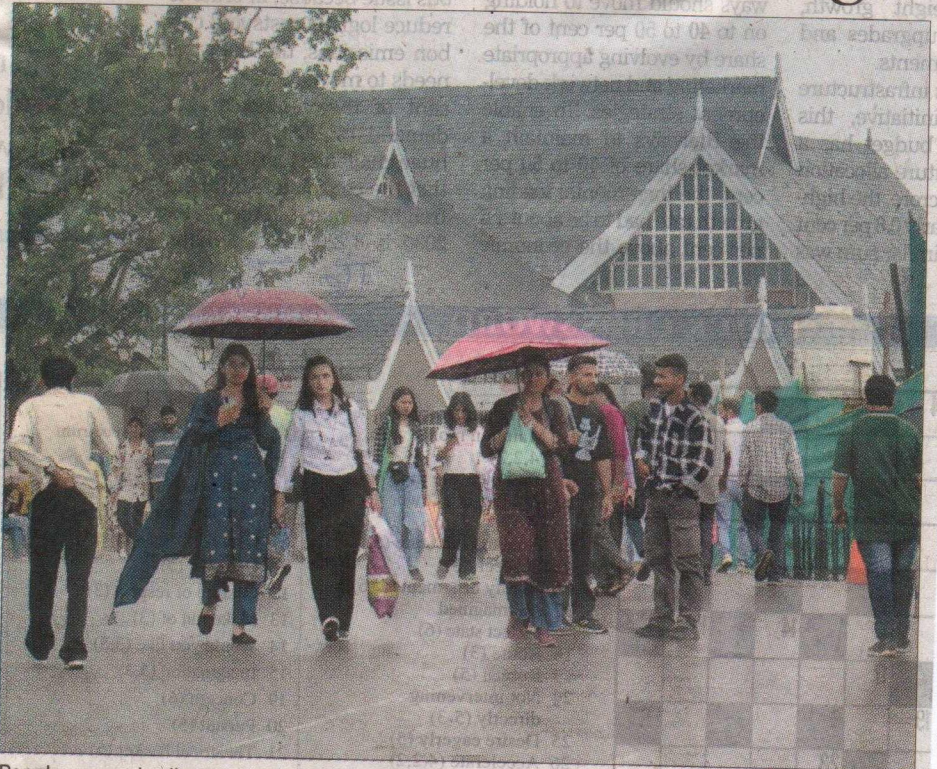
People use umbrellas to protect themselves during rain at the Ridge in Shimla on Sunday.

change in minimum and maximum temperatures during the last 24 hours. Average minimum and maximum temperatures