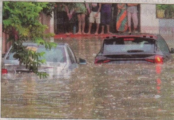
Videos of inundated roads and streets in Gurugram recently went viral on social media. FILE PHOTO

"The officials of the civic agencies were asked to inspect areas where waterlogging was taking place and take remedial measures. They were asked to take steps to divert water from residential