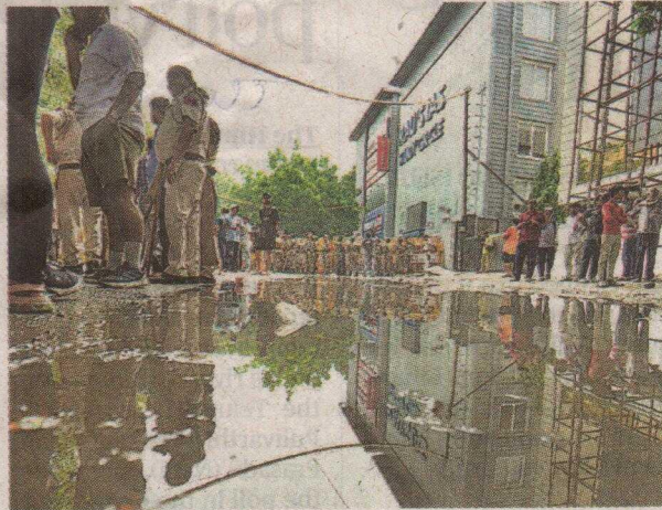
Police personnel stand guard near the coaching centre where three aspirants died, in New Delhi on Sunday.

The total 58 mm of rainfall in a day is not extraordinary during the monsoon season. One of the main reasons for the waterlogging in the city is that Delhi continues to operate on a drainage master plan made in 1976, which is cap-