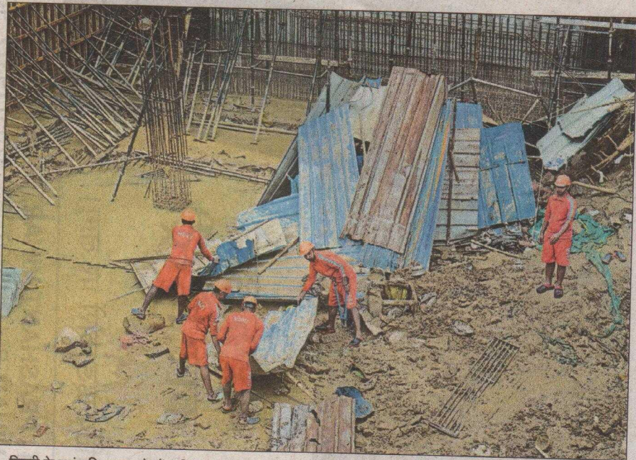
दिल्ली के वसंत विहार इलाके में बारिश के कारण निर्माणाधीन इमारत का बेसमेंट ढह गया। मलबे से तीन शव बरामद किए गए।