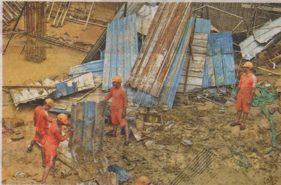
Rescuers removing debris of a wall that collapsed at an under-construction site in Delhi's Vasant Vihar, leading to the death of three labourers. SUSHIL KUMAR VERMA

The official said cranes were used to clear the debris and water was pumped out of a foundation pit to recover the bo-