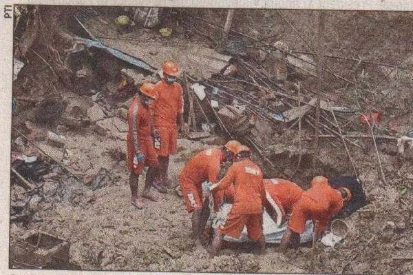
On Saturday, the bodies of three labourers who fell into a pit at a building site in south Delhi's Vasant Vihar on Friday were recovered. The pit had been dug to construct the basement | P 2

A 60-year-old security guard's body was removed from an underpass in Okhla in south Delhi while another body of a young man, about 20 years old, was taken out of the flooded Shalimar Bagh underpass in north-west Delhi on Friday. The latter is still to be identified. Meanwhile,