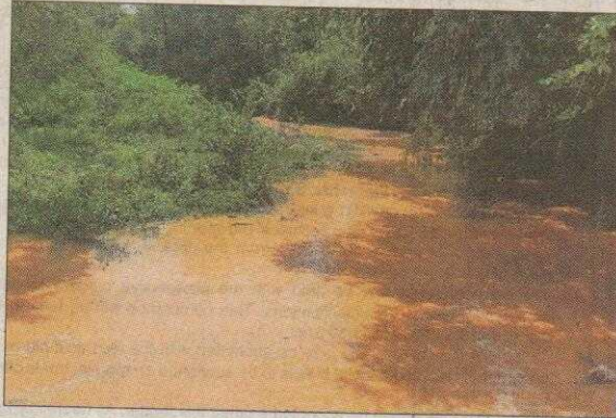
Yellow-coloured water in River Vrushabhavathi near Kumbalagod in Ramanagara district on Monday.

The people living in the vicinity of the river were worried as the river resembled a thick sheet of yellow liquid. A large number of dyeing units and refineries which operate at Anchepalya and Kumbalagod industrial area on the outskirts of Bengaluru, discharge effluents into the river. The water usually turns