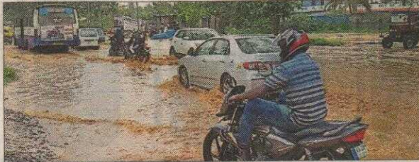
The condition of Varthur village to Gunjur road on Monday after rains. SPECIAL ARRANGEMENT

DECCAN HERALD Wednesday September 25, 2019