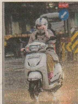
A motorist rides through MG Road.