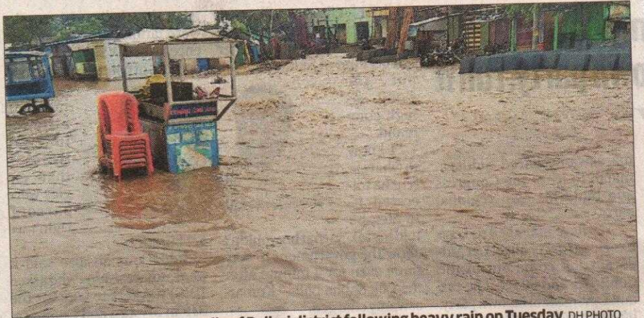
A flooded road in Toranagallu of Ballari district following heavy rain on Tuesday.

It rained for more than two hours in Sindagi, Talikot, Basavanabagewadi and Indi of Vijayanagara district. Kalaburagi, Raichur and Bidar districts in Kalyana Karnataka too received heavy rain disrupting normal life.