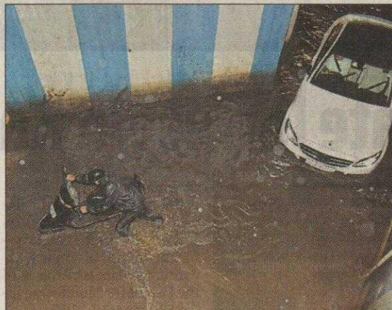
Motorists struggle to pass through the flooded Le Meridien underpass on Tuesday.