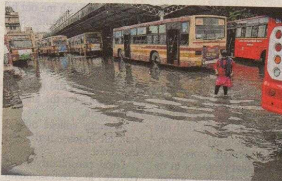
The showers on Sunday left the T. Nagar bus terminus waterlogged.