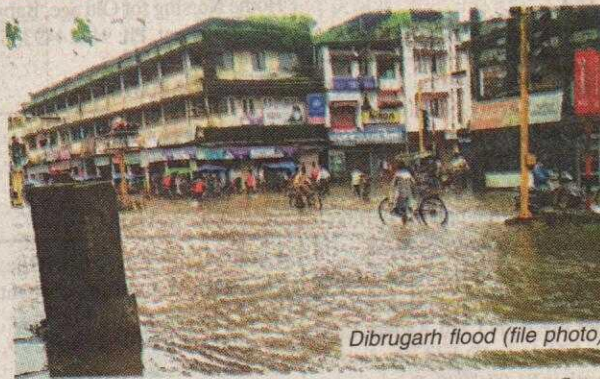
Dibrugarh flood (file photo)

due to the inundation. The deluge has also become a major cause of traffic snarls, especially during the peak hours. It has also made the city very unhygienic. Normal life has been largely affected as movement has become impossible sans conveyance.