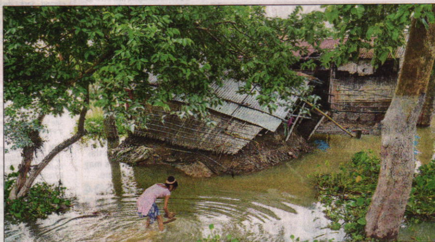
■ A woman washes her slippers in floodwater at a flood-hit village of Assam's Morigaon district on Monday.

Assam The number of deaths touched 66, with two deaths reported from Dhubri and Dhemaji districts. The flood has also claimed the lives of 187 animals, including 16 rhinos in the Kaziranga National Park of Assam