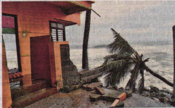
The rough sea has claimed many houses at Valiyathura in Thiruvananthapuram.

Orange alerts signalling the possibility of very heavy rainfall have been issued for Ernakulam, Idukki, Thrissur, Malappuram and Kasaragod for Monday; Thrissur,