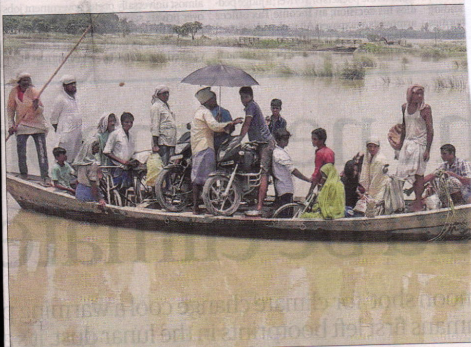
People use a boat to move across a flooded area in Darbhanga, Bihar on Tuesday.