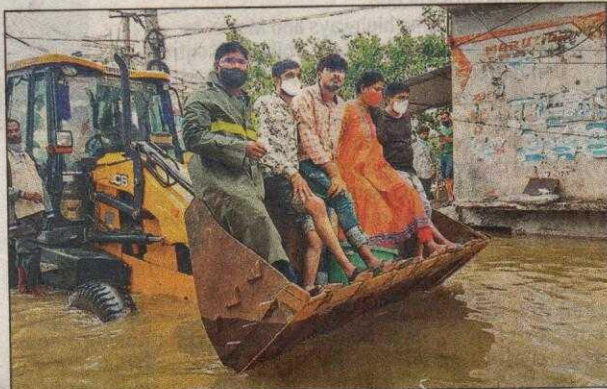
A rescue operation being carried out to shift residents from the flooded Singareni Colony Hyderabad on Wednesday

The city reported at least 18 deaths, but sources said the toll could rise given that there were a number of instances of