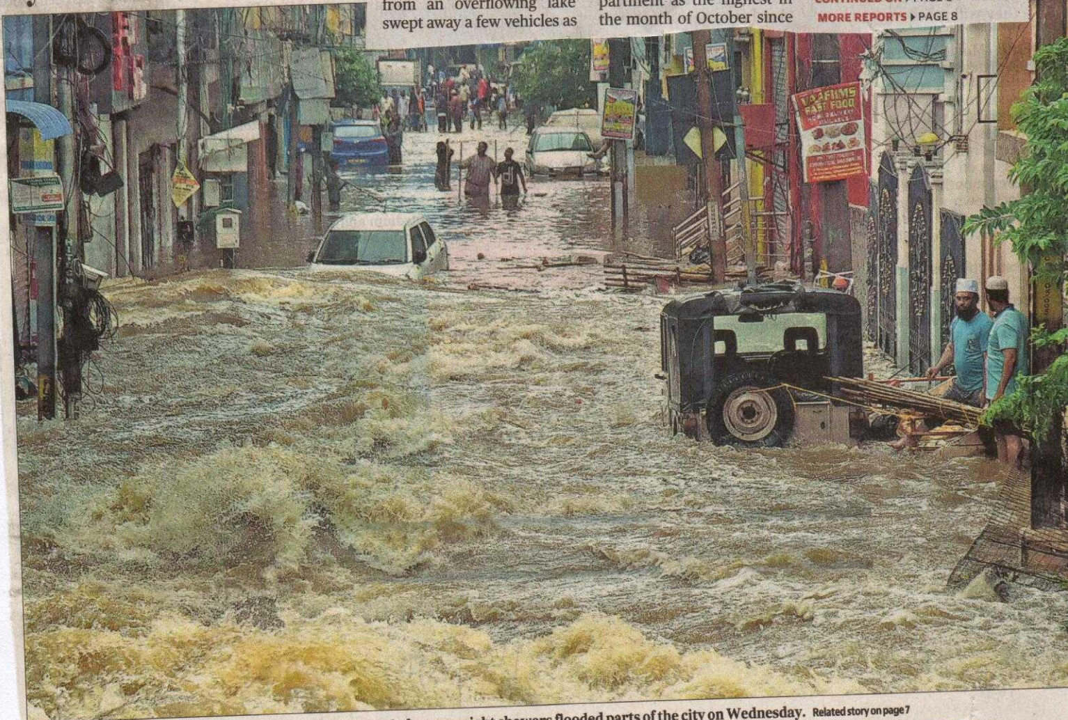
A waterlogged street in Falaknuma area of Hyderabad after overnight showers flooded parts of the city on Wednesday. Related story on page 7