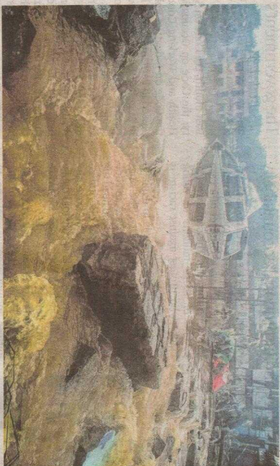
Nature's fury: A scene from Gaganpahad on the NH-44 between Hyderabad city and the airport. Several vehicles were washed away in the area.

Heavy rain (over 6.4 cm) occurred at most places in Siddipet and Jangon, at a few places in Warangal-Rural, Karimnagar and at isolated