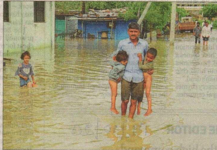
A man carries kids to safety following a flash flood at a residential area in Hungund town of Bagalkot district on Tuesday.