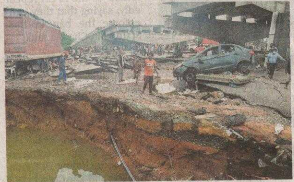
Completely wrecked: The Gaganpahad area where vehicles and a part of the road were washed away.

The main roadway link between Hyderabad and Bengaluru, National Highway 44, was snapped on Tuesday night, after water from an overflowing lake swept away a few vehicles as