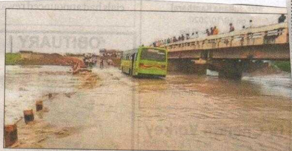
A KSRTC bus navigates on the submerged Inamahongal bridge, in Belagavi district on Monday. Several bridges in the district have submerged due to heavy rain.