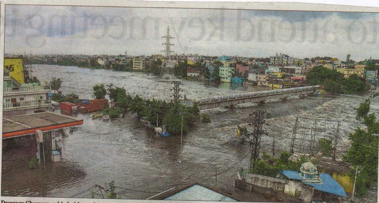
Durgam Cheruvu cable bridge submerged under floodwater following heavy rain in Hyderabad on Wednesday.