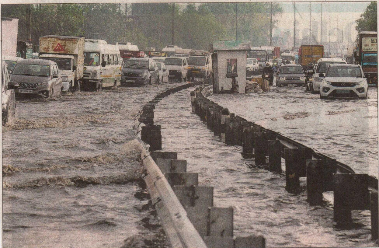
Vehicles drive through a waterlogged NH-48 near Narsinghpur village in Gurugram,