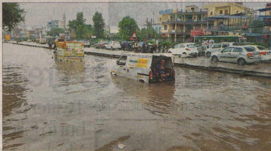
A waterlogged road following a heavy rainfall in Gurugram on Wednesday.

Teams of the police and the Gurugram Metropolitan Development Authority (GMDA) were present at key areas to drain out rainwater through pumps.