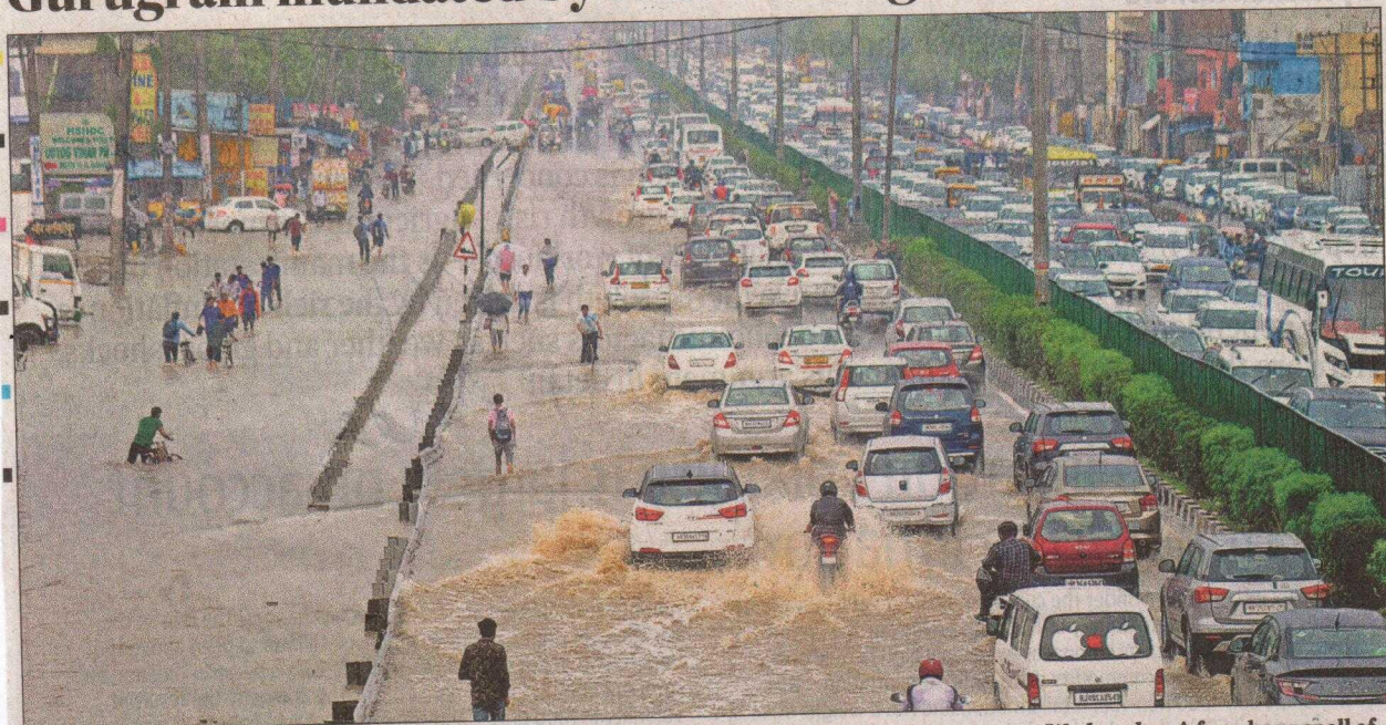
Vehicles wade through a waterlogged stretch of NH-48 near Narsinghpur village in Gurugram on Wednesday. A four-hour spell of rain in the morning was enough to bring Millennium City to a standstill.