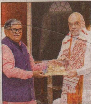
Home minister Amit Shah with Assam governor Gulab Chand Kataria in New Delhi on Monday

So far, 109 human lives have been lost in Assam due to floods and nearly six lakh displaced in several districts. In UP, more than 54 people have died in flood-related incidents and nearly 1,500 villages in 22 districts are affected.