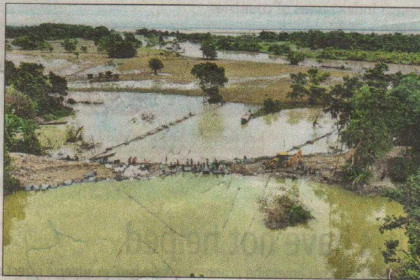
The death toll in the Assam floods has risen to 96, with more than 597,600 affected.

The assurances come as the death toll in Assam alone climbed to 96, with more than 597,600 people affected across