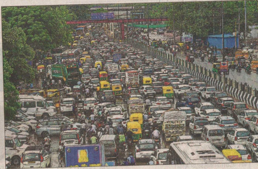
नई दिल्ली में सोमवार को भारी बारिश के कारण मजनु का टीला रोड पर लगा लंबा जाम।

मौसम विभाग के अनुसार, दिल्ली में हल्की बारिश का दौर अगले कुछ दिनों तक जारी रहेगा। बीच में मध्यम श्रेणी की बारिश होने का भी अनुमान है। सोमवार को मानक वैधशाला सफदरजंग में 2.7 एमएम बारिश दर्ज की गई। रिज में 37.2 एमएम जबकि पालम में 31.8 एमएम दर्ज की गई। दोपहर में तेज धूप निकलने से शाम होते-होते उमस भी ज्यादा हो गई। इस कारण अधिकतम आद्रता 88 फीसदी और न्यूनतम 59 फीसदी दर्ज की गई।