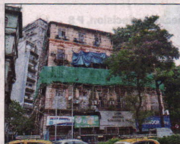
(Clockwise from top) Sion-Panvel Highway on Monday; a portion of this Opera House building collapsed; a family on bike at Vashi; Turbhe police station; sea of umbrellas at Sion