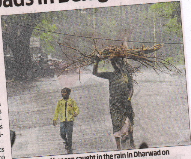
A woman and her son caught in the rain in Dharwad on Monday.

Chandbawadi bridge over Pandri river, a tributary of Kali, has been submerged as