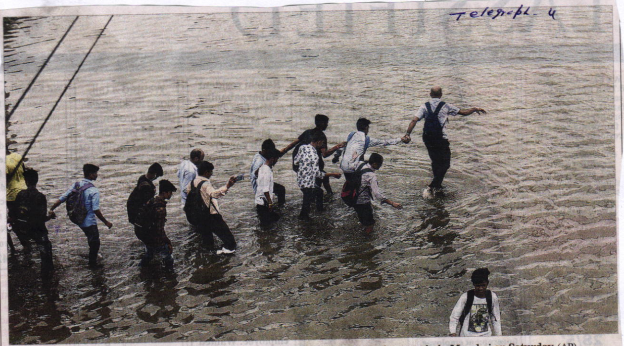
Commuters hold hands and walk past flooded train tracks following heavy rain in Mumbai on Saturday.

The Deccan Herald ( Bengluru ) The Deccan Chronical ( Hyderabad ) Central Chronical ( Bhopal )