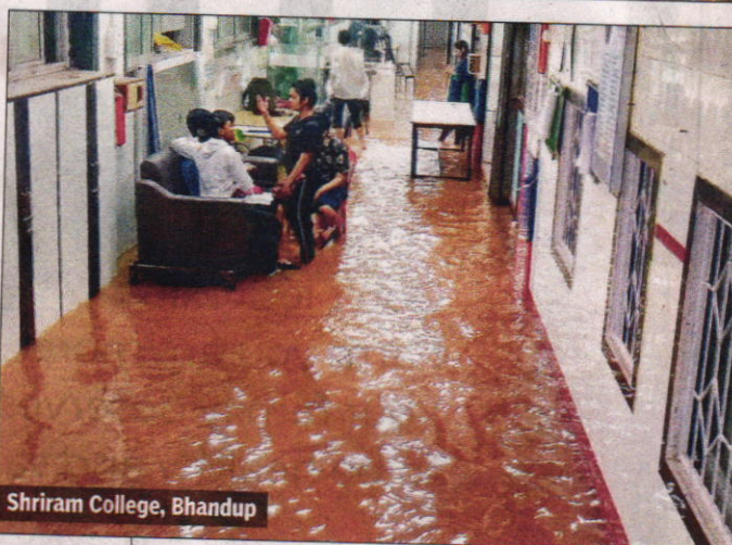
Shriram College, Bhandup

Very likely | 51-75% probability of rainfall Orange alert | Be prepared Red alert | Take action