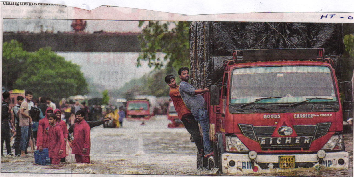
People waded through a flooded road on Sunday as Mumbai logged a record 204mm overnight rainfall.

The Deccan Herald ( Bengaluru ) The Deccan Chronical ( Hyderabad ) Central Chronical ( Bhopal )