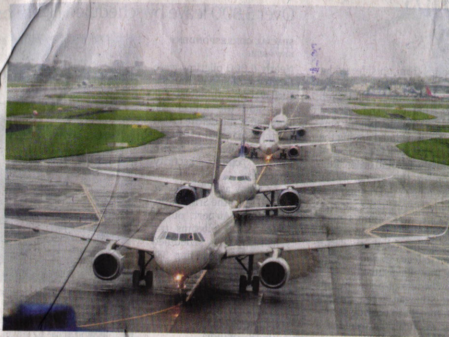
In line: Aircraft waiting in queue for taking off at the Mumbai airport on Saturday. Heavy rain lashed Mumbai, Thane and Palghar districts on Saturday.

in severe waterlogging on the tracks between the Kurla and Sion stations.