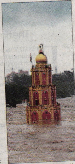
A temple is seen submerged in overflowing Godavari in Nashik

Power supply remained cut off, while road and communication networks were badly hit in the two districts, it said. As per preliminary estimate, the damage to roads and other