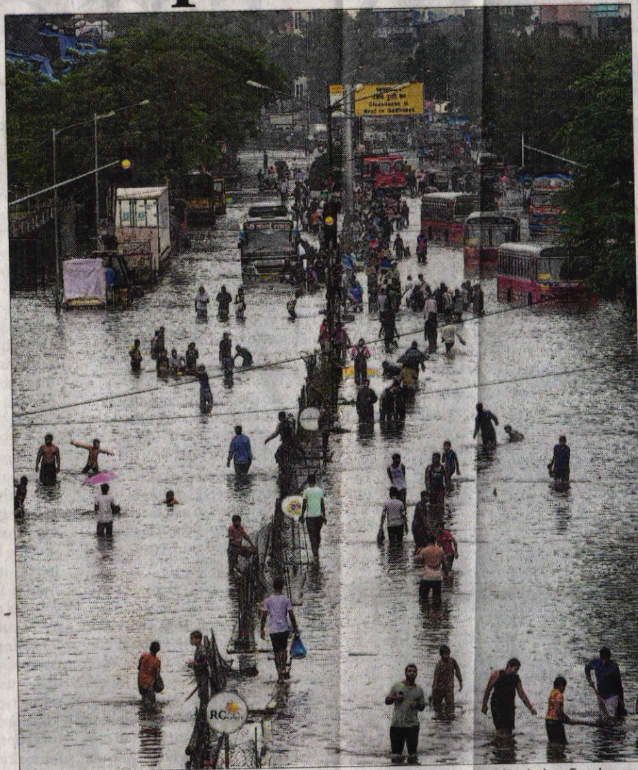
A view of the waterlogged LBS road after the water level of Mithi river rose, in Mumbai on Sunday.

District officials have declared a holiday on Monday in many places as the weather department warned of continued heavy rains. Schools have been ordered closed in Pune, Palghar and Thane districts, the officials said.