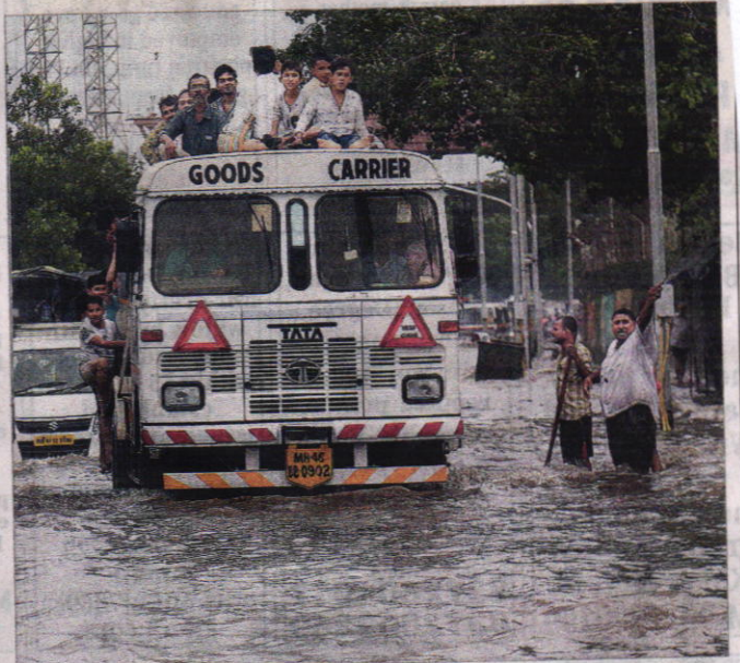
People sit atop and hang from a vehicle on a waterlogged Mumbai street.