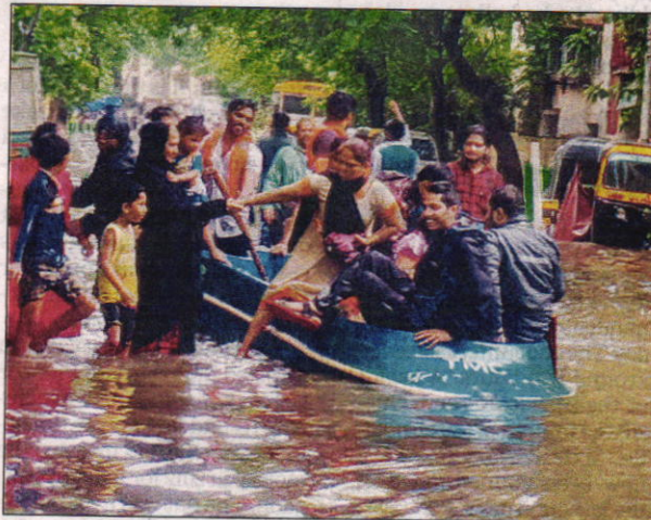
Boats were deployed in Thane as several areas went under water