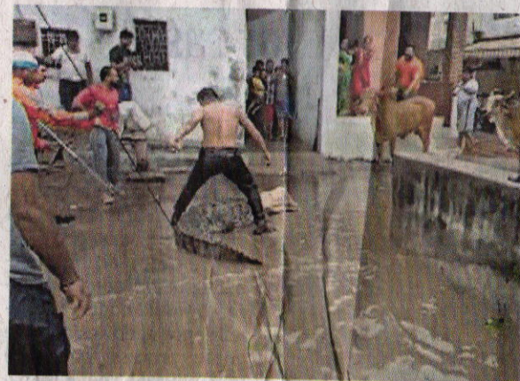
Unlikely visitor: A crocodile being rescued by an NDRF team from Vadodara, Gujarat on Saturday.

Mangrol in Surat received 269 mm rainfall in the 24 hours till 8 a.m. on Saturday, as per the State Emergency Operation Centre data. The downpour resulted in several areas getting water-logged and the Kim and Auranga rivers flowing near the danger mark, officials said.