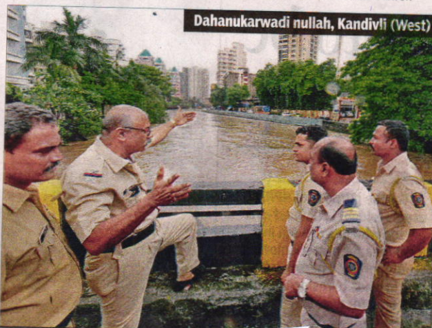
Dahanukarwadi nullah, Kandivli (West)