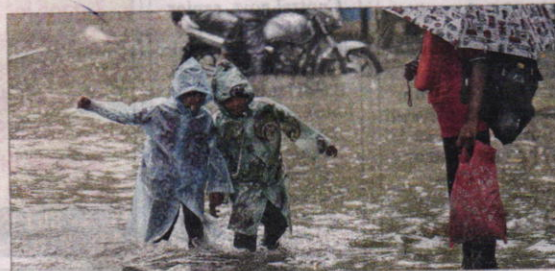
Children make a splash on a flooded street in Mumbai.