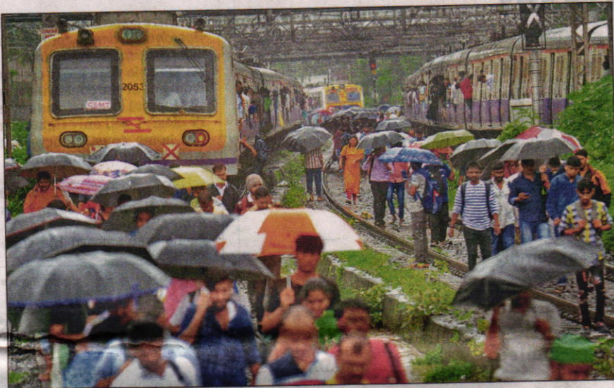
With railway services coming to a halt, scores of passengers had to walk on the tracks