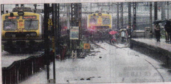
People cross waterlogged railway tracks in Thane on Saturday.