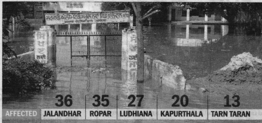
An inundated government school at Nawan Pind Khalewal in flood-hit Shahkot, Jalandhar.