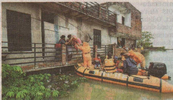
Displaced by rain: A National Disaster Response Force team evacuating people at Salori in Prayagraj on Wednesday.

The department said 605 villages were hit by floods in